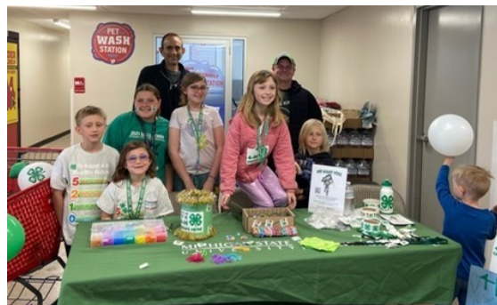
Pictured above with the Sterling Heights TSC store manager, 4-H REBELS members promoted 4-H during the store's 2025 Spring 4-H Paper Clover Campaign. The campaign ran April 18-May 5.

We have received the results of TSC's Fall 2024 4-H Paper Clover Campaign from TSC National. Thanks to donations received during the Fall 2024 campaign, Macomb County 4-H will receive $1,171.77 to be used primarily for scholarships for 4-H members to attend 4-H programs, workshops and events. The TSC Campaign raised a total of $66,778.58 for Michigan. Of this amount, $40,067.14 is distributed for support of county 4-H programs, $6,677.86 for state 4-H programs, $6,677.86 for 4-H statewide learning experiences, $6,677.86 for 4-H foundation, and $6,677.86 is maintained by National 4-H Council for their administration of the TSC campaign. This distribution represents 60% of total revenues generated within your local TSC stores.